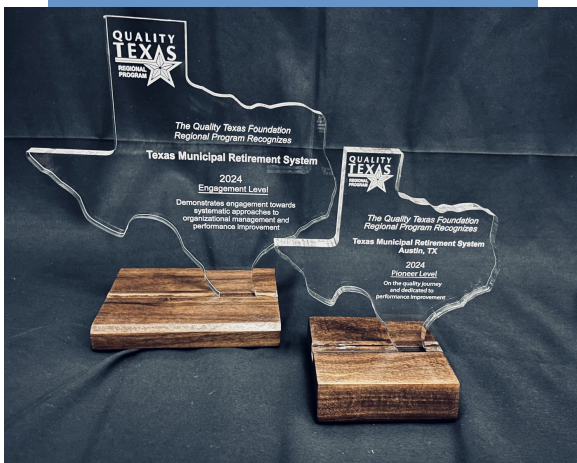
Quality Texas Foundation Engagement and Pioneer Level Awards

Congratulations to our entire organization for the exceptional efforts improving quality for the benefit of our 220,000 Members, retirees and beneficiaries! ★